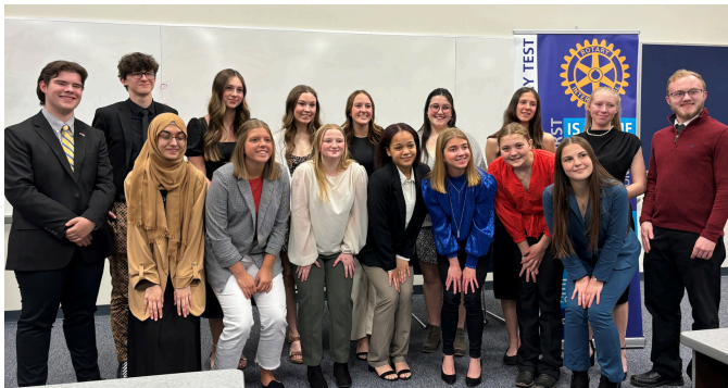
Sixteen high school students competed in the contest.