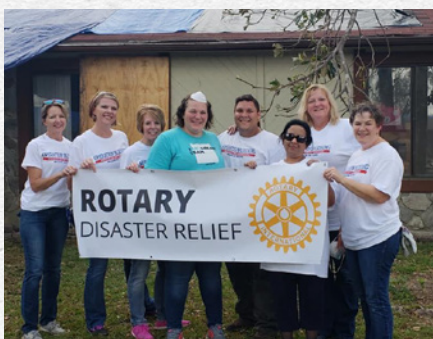
Tiffin Rotarians turned a vacation into a service project by helping in Panama City with hurricane relief efforts.