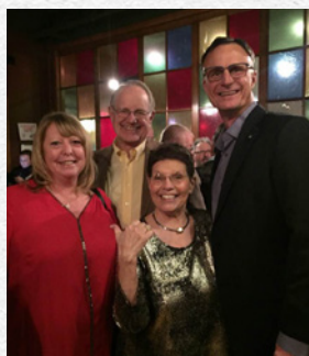
The District 6600 International Yachting Fellowship of Rotarians (IYFR) celebrated the season with a holiday party at The Oliver House in Toledo.