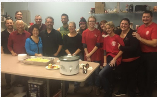
Maumee Rotaract and Rotary joined together to serve meals at Mosaic Ministries in Toledo.