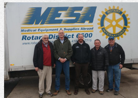
Mansfield Rotarians helped obtain a truckload of dental equipment and supplies and delivered it to the MESA warehouse.