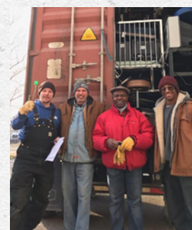
The first container shipped by MESA this year headed to Nigeria. Next stop Thailand and Honduras.