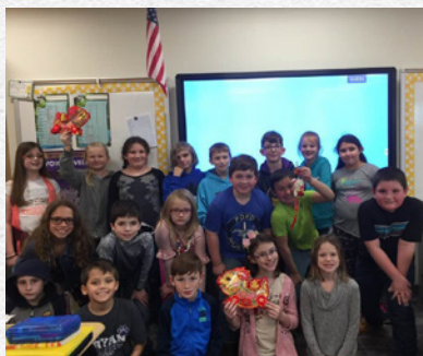
Bryan Rotary's "Rotary Reads" program pairs Rotarians with elementary classrooms to read on a weekly basis.