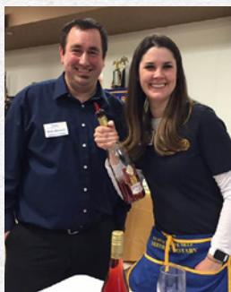
Amherst Rotary hosted a wine tasting and auction with some amazing items (plus wine!).