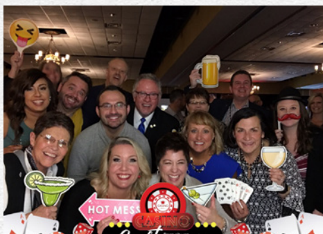
Rotarians from Toledo, Tiffin, Maumee, Oberlin and Sandusky celebrated at Perrysburg Rotary's Casino Night on Feb 2, 2019.