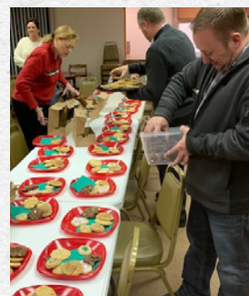
A sweet project! Grand Lake Rotarians put together plates of cookies to sell for a fundraiser.