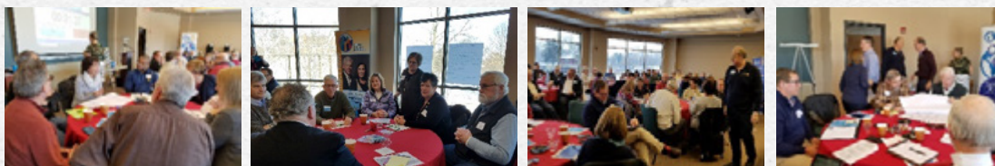
OUR TEAM HARD AT WORKING AT THE ONE ROTARY SUMMIT! ENGAGED! PEOPLE OF ACTION!