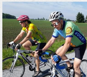
MESA Bike Riders enjoyed another successful ride the first week of June with stops all throughout the district. This year's ride raised over $30,000 and built lots of goodwill and friendships!